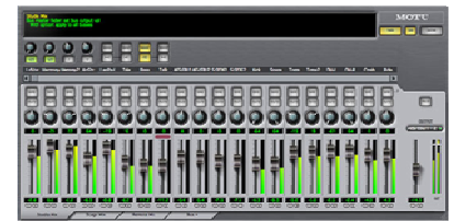
MOTU Traveler + CueMix